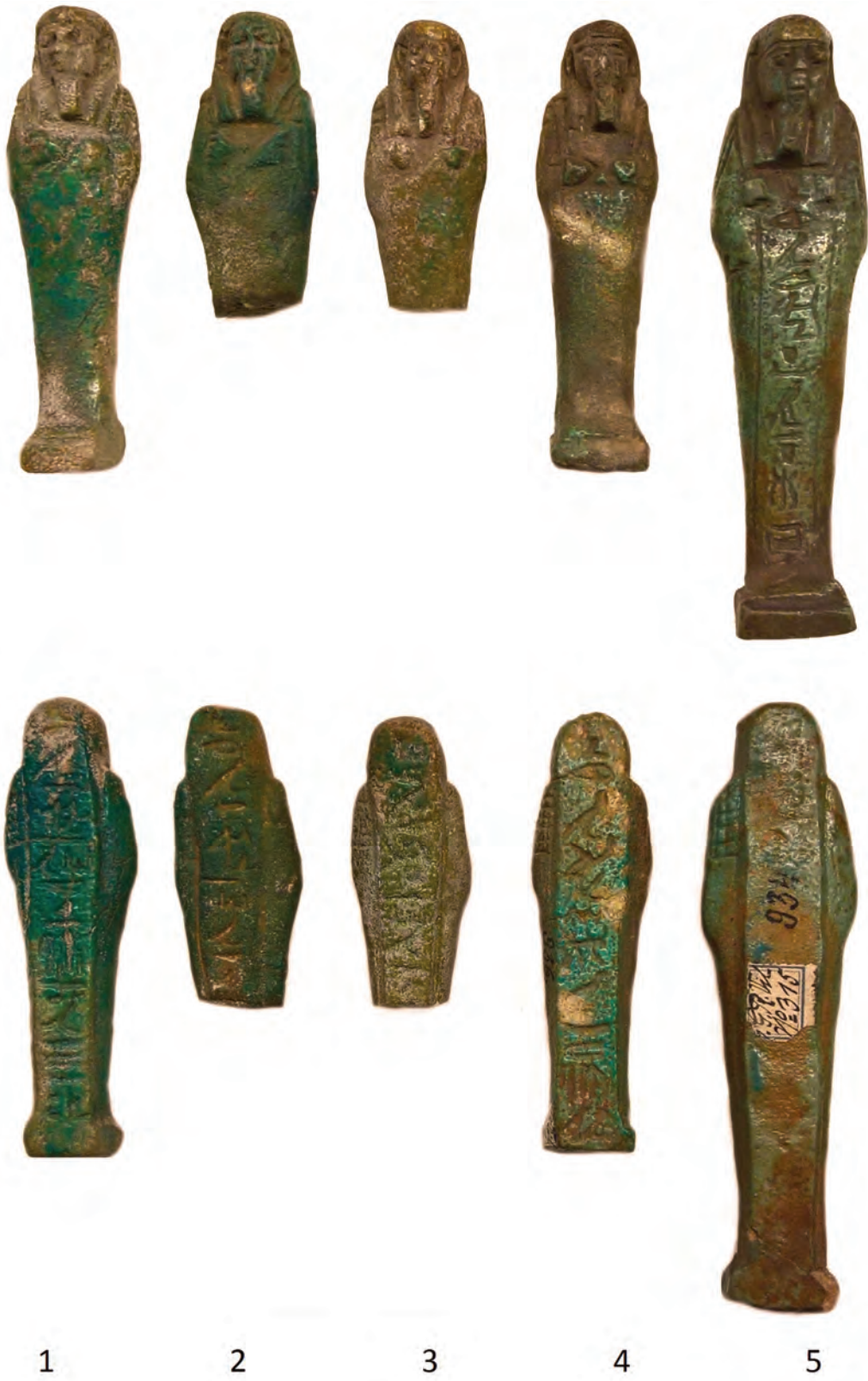
Pl. 2/1: Shabtis from the collection of the Institute of Classical Archaeology, Prague: nos 1-5.