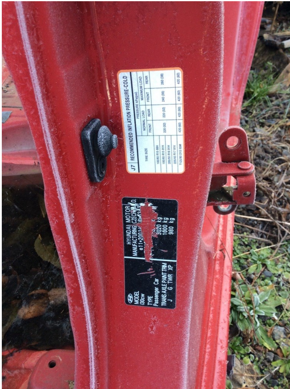
Figure 6. Removed VIN code.

aptly points out, “it’s an economy on wheels that reminds us that waste can be commodified” (Hawkins, 2005, p. 93).