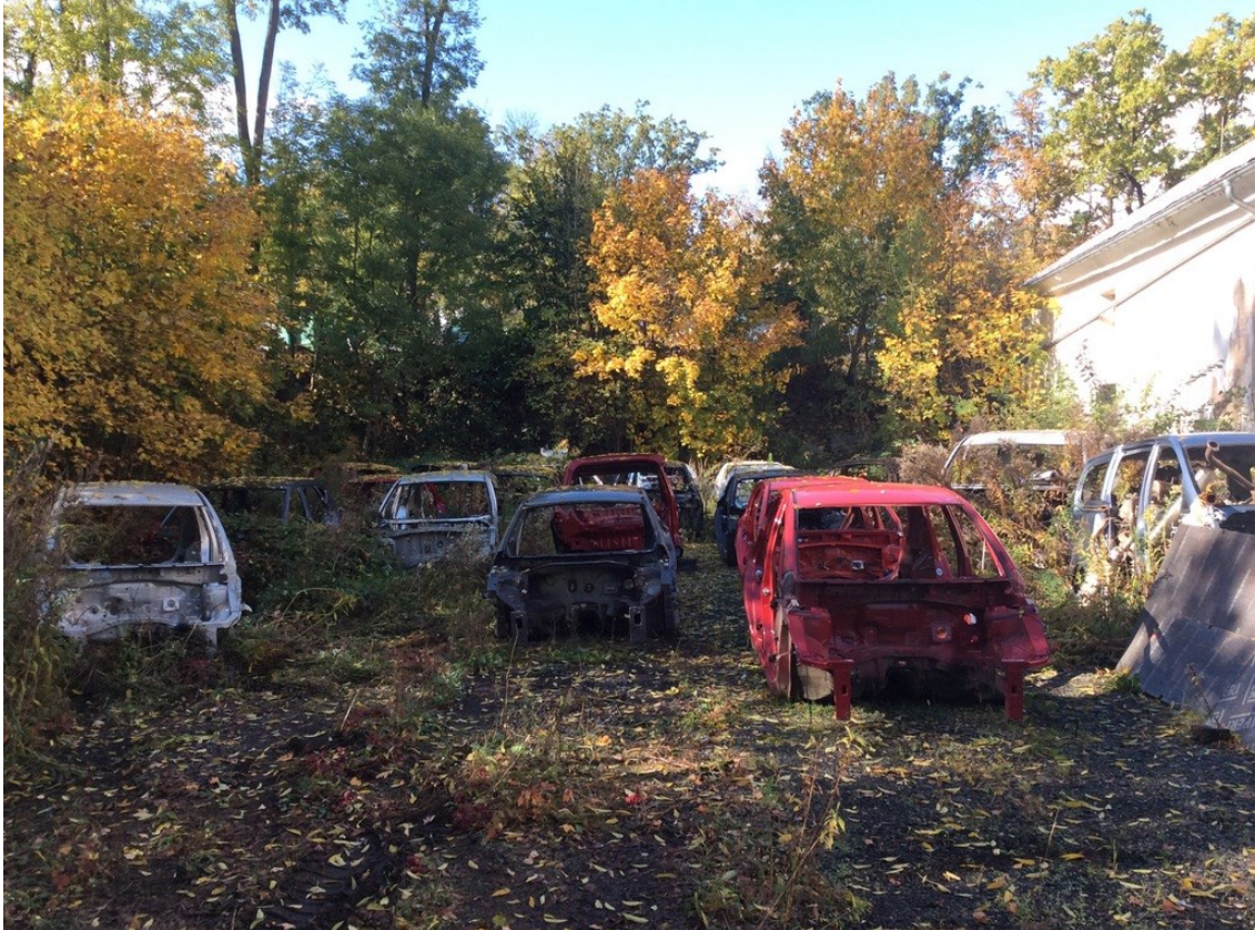
Figure 7. Car bodies waiting for their time to be reused.

Late on a sunny morning in September 2019, just before lunch break, Pan Vedoucí left the yard. Hynek and I decided to use this rare moment without anyone checking up on us to chill, chat, and stroll the yard. We spent a significant part of the time throwing stones at an old car window. While still chatting, we stopped at a car that seemed untouched by us, the salvage yard workers, yet had been placed among the metal