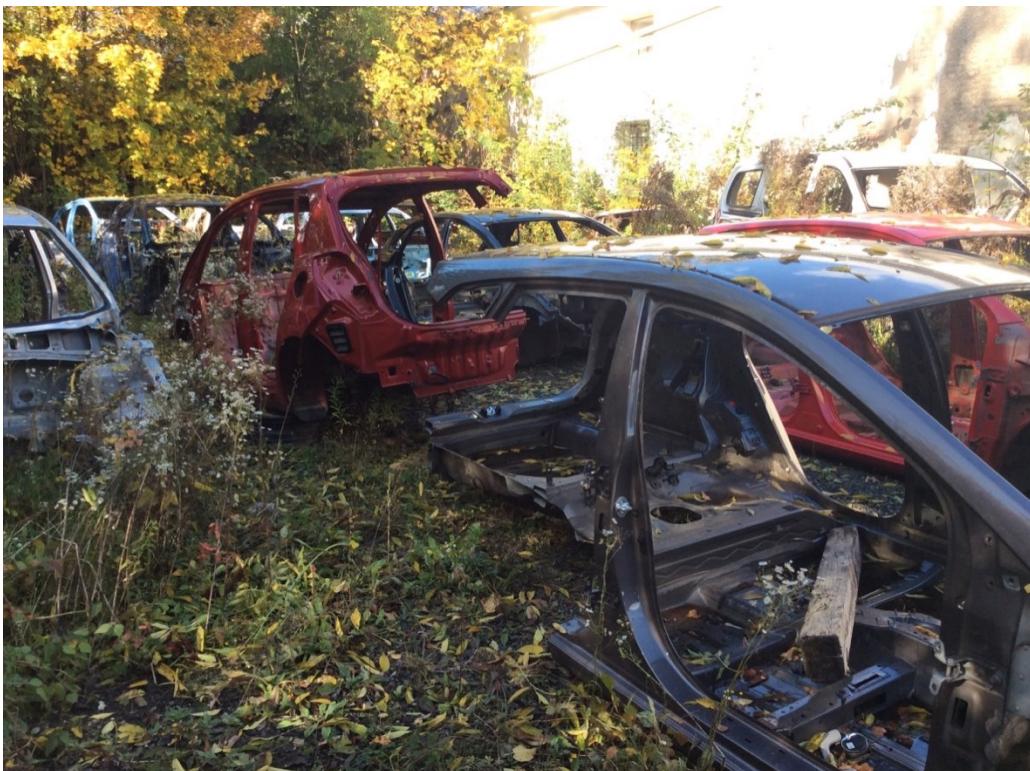
Figure 10. Car bodies missing their parts that were "glued" into another cars' bodies.