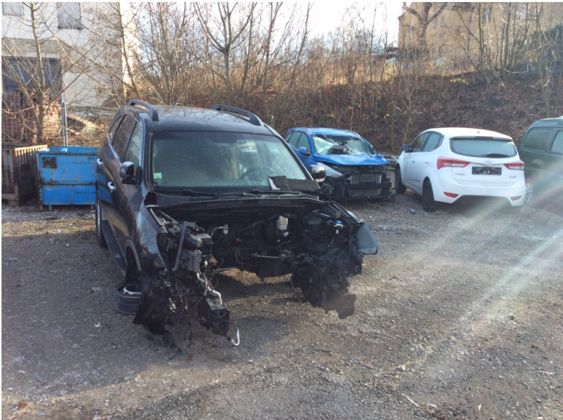
Figure 11. The IX55 missing its heart.

“Sixty-two thousand?” asked the stockier of the two men in a strong Eastern European accent.