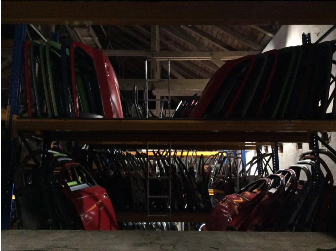
Figure 1. Former sugar factory storage house, nowadays serving for storing car body parts.

The yard was bounded and separated from the road by two of the aforementioned brick buildings on the western side and by a beautiful old wooden warehouse on the northern side. Behind that wooden warehouse—which smelled so nice, especially during summer, and reminded me of the smell of my grandparents’ old coal shed or old wooden railway sleepers—was a sawmill owned by another entrepreneur. At the eastern part of the yard, on a hill, there was a charming multi-storey building, the former sugar factory’s administrative building from the 1870s, which serves as an apartment building nowadays.