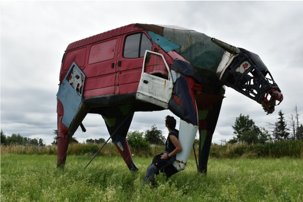
Figure 12. The author

Today, for the first time, it occurred to me that I have reached saturation.