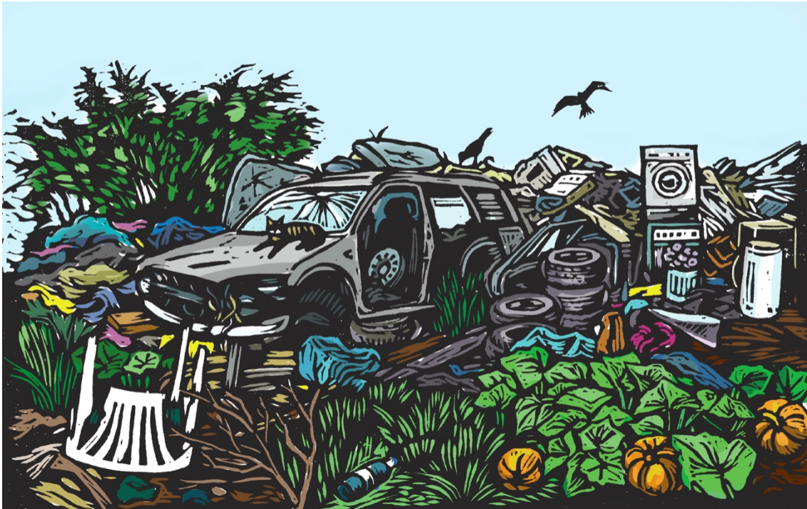
Figure 4. The yard as the Czech illustrator Dora Čančíková sees it. This illustration was originally made for our “Waste Regime at a Crossroad: Divergent Trajectories of Things, Cars, and Electronics” project ( www.wasteregime.cz ).