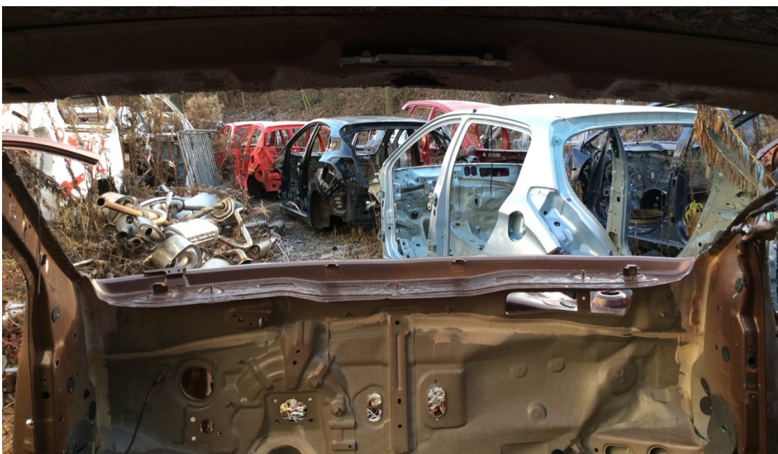
Figure 2. Processed car bodies hidden from the eyes of the yard's visitors.

Behind one of the brick warehouses was a space hidden from the view of the yard's visitors and, thus, contained processed car bodies waiting for their second life, all with their VIN (Vehicle Identification Number) codes removed. They were placed there to hide the yard's informal activity, that is, disposal of totaled cars, which was, in fact, illegal at that place. Next to these car bodies, one could find plastic containers for municipal waste containing all kinds of valueless stuff from the dismantling of the cars. There, unlike in the yard's visible part, chaos ruled, and that place was anything but tidy. No customer could visit the inside of the warehouses, as there were also traces of illegal activity, and probably none of them would realize that there were car parts worth millions of Czech crowns being stored.