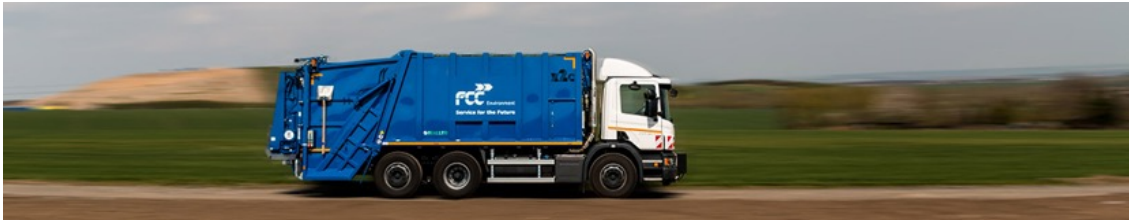
Figure 5. “FCC Environment: Service for the Future” garbage truck.

of waste generated during the dismantling of cars indicated that the three men in the vehicle were sanitation workers. As Alexander (2016) points out, the word waste disappears from public space. It is being replaced by various short text slogans, which in all cases contain the prefix “eco-“ or the words “future,” “recycling,” “sorting,” or “the environment,” as in the case of the blue truck.