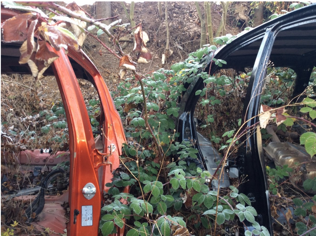
Figure 9. The yard's "entropy."

The auto salvage yard where I worked and conducted my research was divided into clear sectors; each of them had huge or small containers that functioned as intermediate stopovers for the trajectories of flowing waste. The order imposed on the yard fought against a persistent natural entropy. At some points entropy nevertheless dominated—since everything was always in the process of changing into something else (Ingold, 2011, p. 3; Reno, 2016, p. 9)—and one could see a slightly different world, such as the forgotten heavy metal beams being absorbed by tree trunks and shrubs, or life emerging inside the metal skeletons of the oldest cars: nests of slow-worms ( slepýš ), which are endangered and are thus a protected species in the Czech Republic.