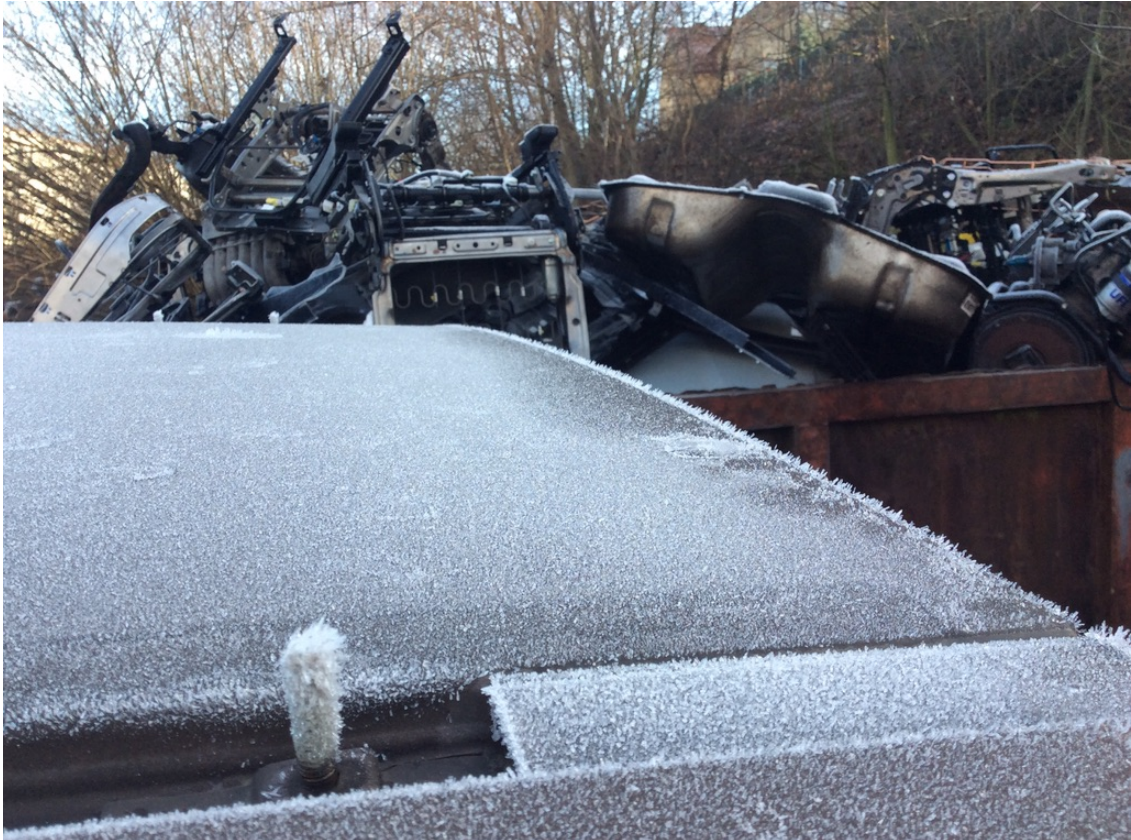
Figure 8. A freezing morning in the yard.

It was a sunny but cold morning in November 2019, and all the car bodies in the yard were covered with lace blankets knitted from frost. The naked, processed cars ready to be taken to a metal scrapyards looked like crafted goods from the display of a crystal glass shop in the tourist areas of Prague's Old Town, or like the excavated skeletons of future ancient beings. I was enjoying playing with my imagination while sipping coffee when Hynek's voice yanked me back: "Are you still sleeping or what?"