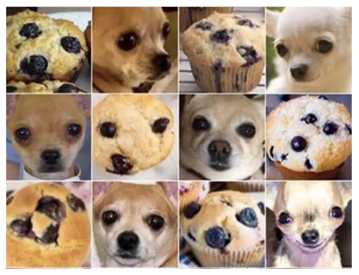
Picture 3 – AI trying to distinguish a Chihuahua or a blueberry muffin.<sup>135</sup>

Third aspect of data processing is aspect of uncertainty. There is a saying that machines never do mistakes, humans do, and while there is certain wisdom in that quote, for purposes of regulation we need to be prepared for situations, where machines make mistakes also. The question of responsibility and liability for incorrect decision-making made by machine is obvious here and has been exhaustingly debated over the last decade. For further reading I recommend Comparative law study on civil liability for artificial intelligence.<sup>134</sup> What has not been as debated is the aspect of uncertainty, this is true especially with neural network-based AI, where results are of probabilistic nature. For example, AI is given a picture and is asked to classify what is on said picture.